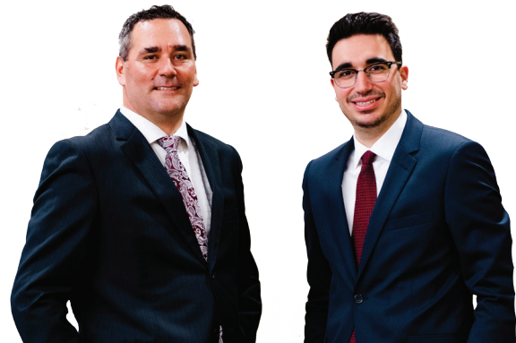
Morris Wealth Advisory Group TD Wealth Private Investment Advice